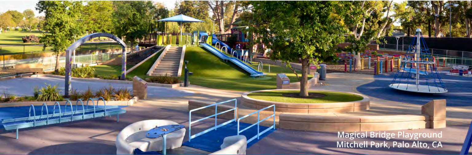
Magical Bridge Playground Mitchell Park, Palo Alto, CA